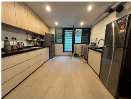
女生宿舍 Girl's dorm