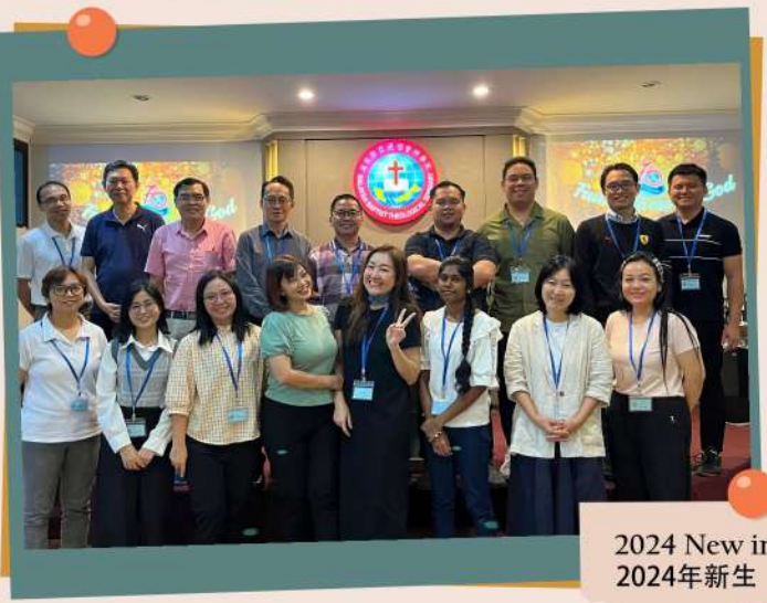
2024 New intake 2024年新生