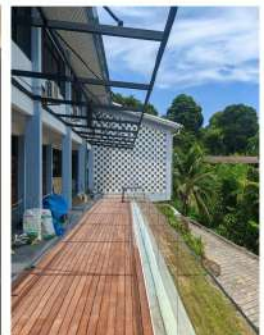
礼堂外走道 Viewing Deck