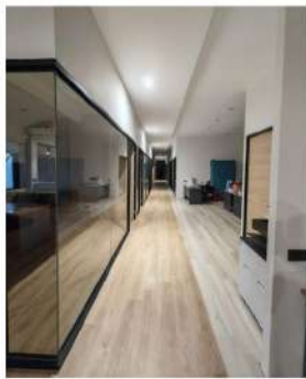
行政办公楼 Admin A Office

Thank the Lord for initiating the renovation of the campus in Penang last year, including repairing landslide areas. Now, a large portion has been completed, including renovations to the female dormitories, the main administrative building A (for the president, academic affairs, and finance departments), prevention of landslides, dormitory window and railing repairs, upgrading of pathways outside the auditorium, railing painting, and drainage ditch repairs. Thank you for your prayers. There is still a lot of funding needed, so if you feel moved, please continue to contribute.